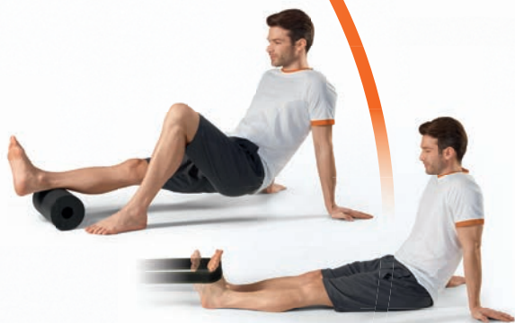
Special exercise programmes