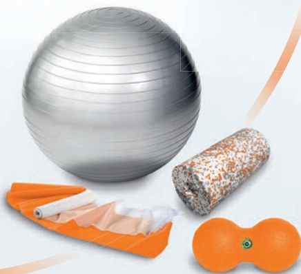
Helpful, tried and tested training equipment