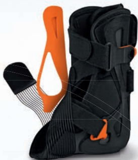
Functional aids and appliances