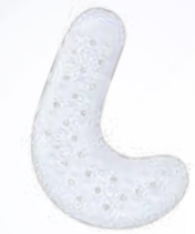
SPORLASTIC AIR-MATRIX silicone pad

Ankle support with nopped AIR-MATRIX silicone friction pads