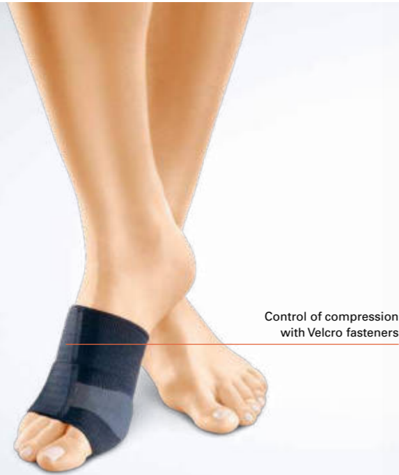
Control of compression with Velcro fasteners