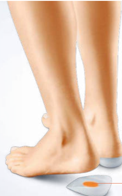
Medial soft sport for calcaneal spur relief

Visco-elastic heel cushion made from silicone with "soft spot"