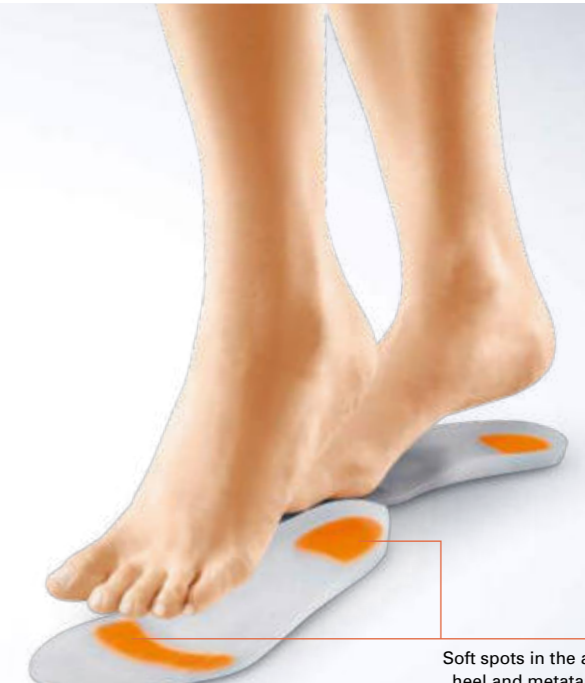
Soft spots in the area of the heel and metatarsal heads

Visco-elastic inlays made from silicone with "soft spots"